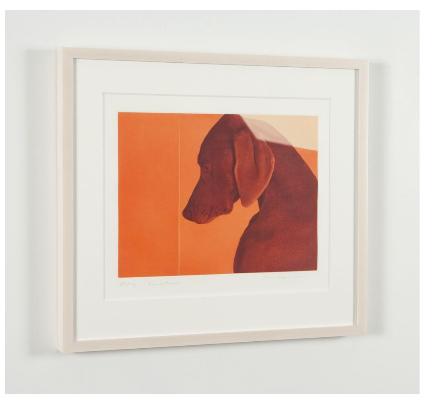
Artist: William Wegman