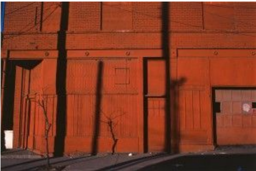
Harry Callahan Kansas City, 1981 dye imbibition print overall (image): 24.3 x 36.7 cm (9 9/16 x 14 7/16 in.) National Gallery of Art, Washington, Gift of The Very Reverend and Mrs. Charles U. Harris