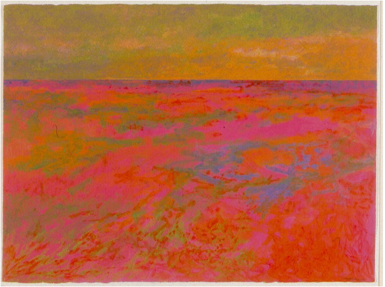
Spirit Path, New Day, Red Rock Variation: Lake Superior Landscape, 1990, acrylic and pastel on paper, 22 1/2 x 30 1/8 in. Collection Minnesota Museum of American Art.