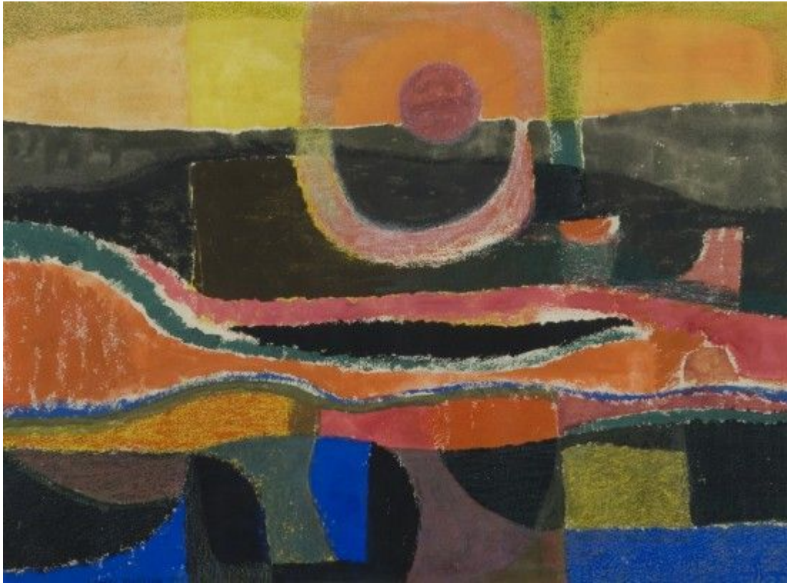
Sun and River, 1949, watercolor and crayon on paper, 15 3/4 x 21 in. Copyright Plains Art Museum. From the permanent collection of the Plains Art Museum, Fargo, North Dakota.