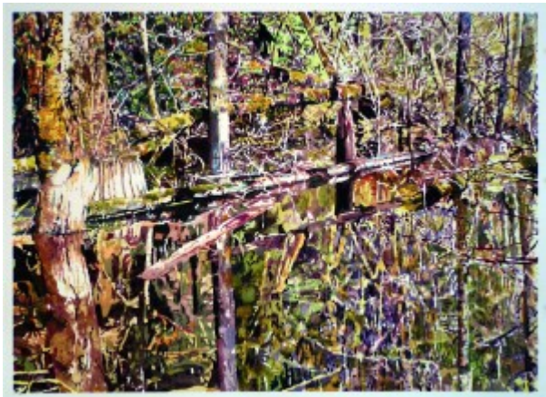
"Deep Enough for Ivorybills"