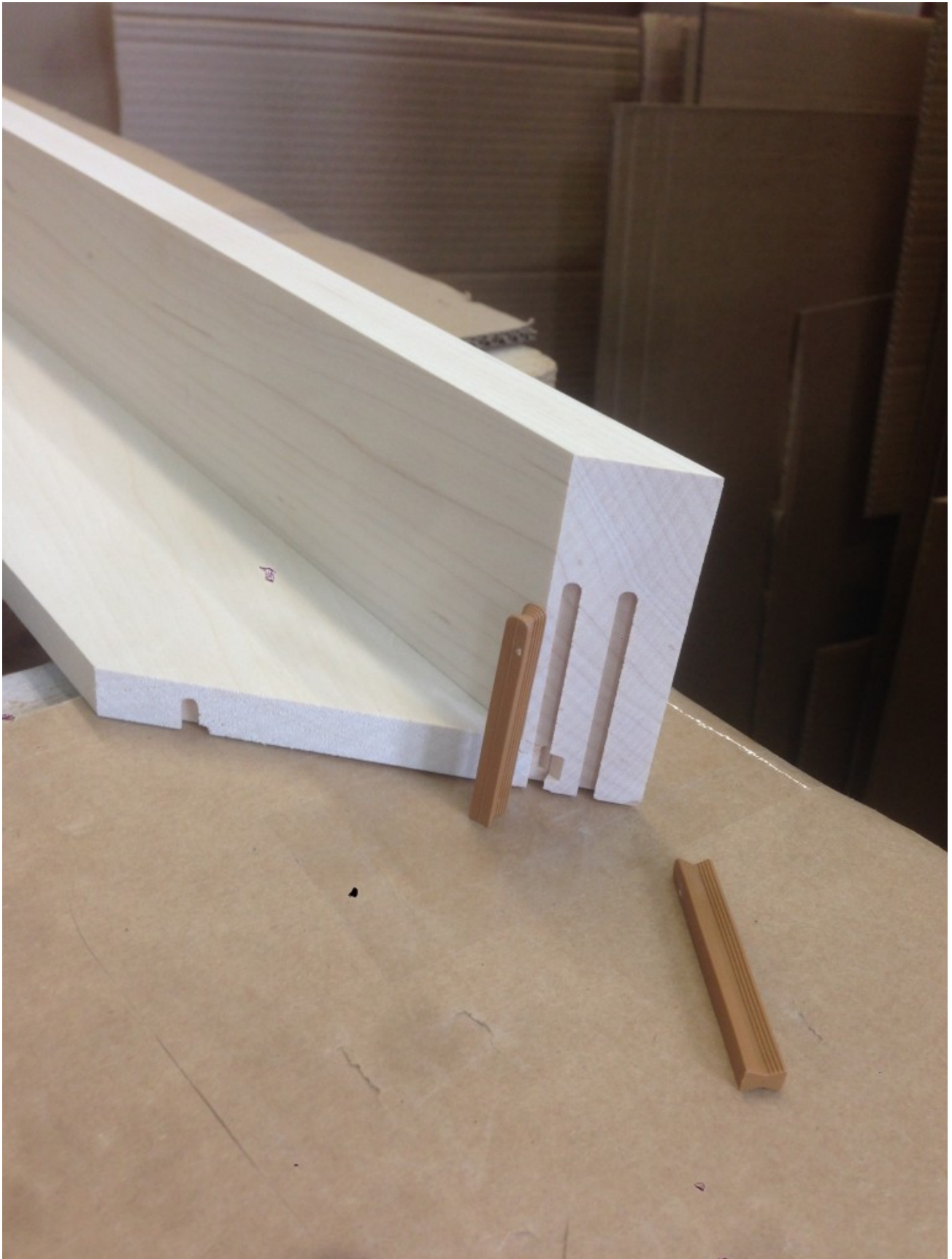
Metropolitan routed out the ends of the frames and supplied the wedges so the customer could join the frame.