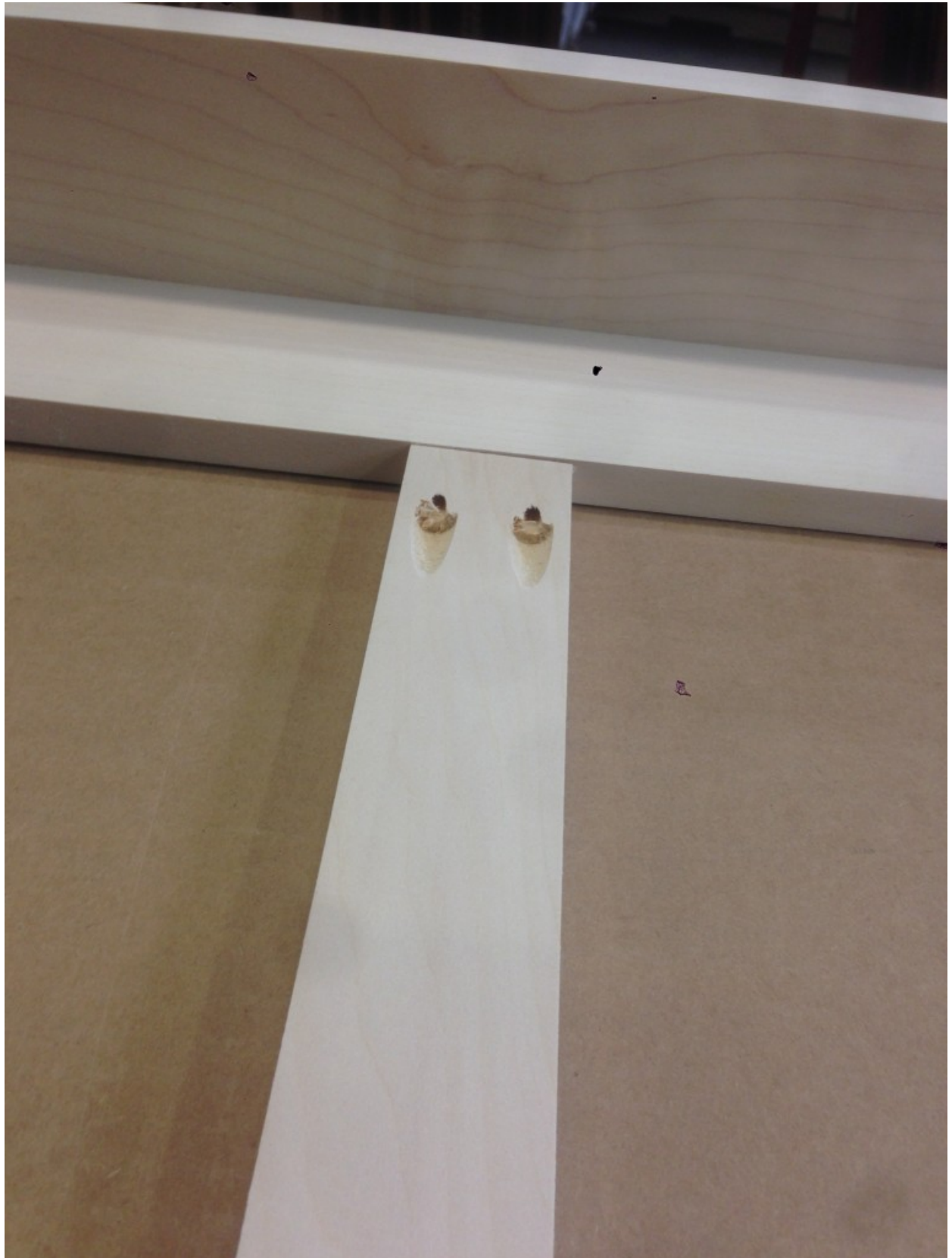
Metropolitan drilled holes and provided screws for crossbars.