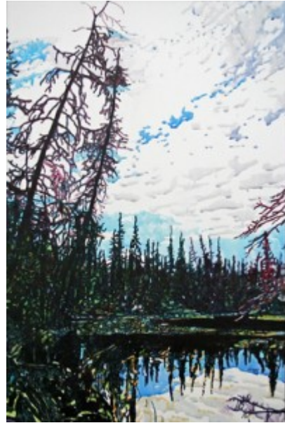
"Water From the Rock"

"Kes Woodward: New Work" July 3 – July 26, 2014 Blue.Hollomon Gallery Anchorage, Alaska