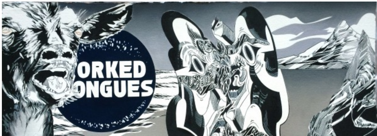
detail shot of 'Forked Tongues' 2014 (11.5" x 30") ink, oil and gouache on paper