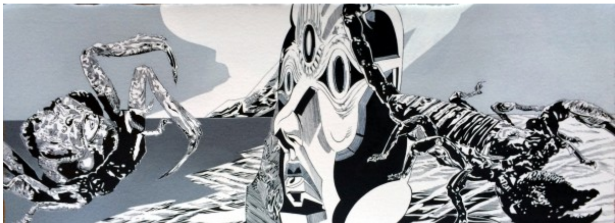
detail of 'Ink Babel' 2014 (each panel approx. 11.5" x 30") ink and oil on paper.