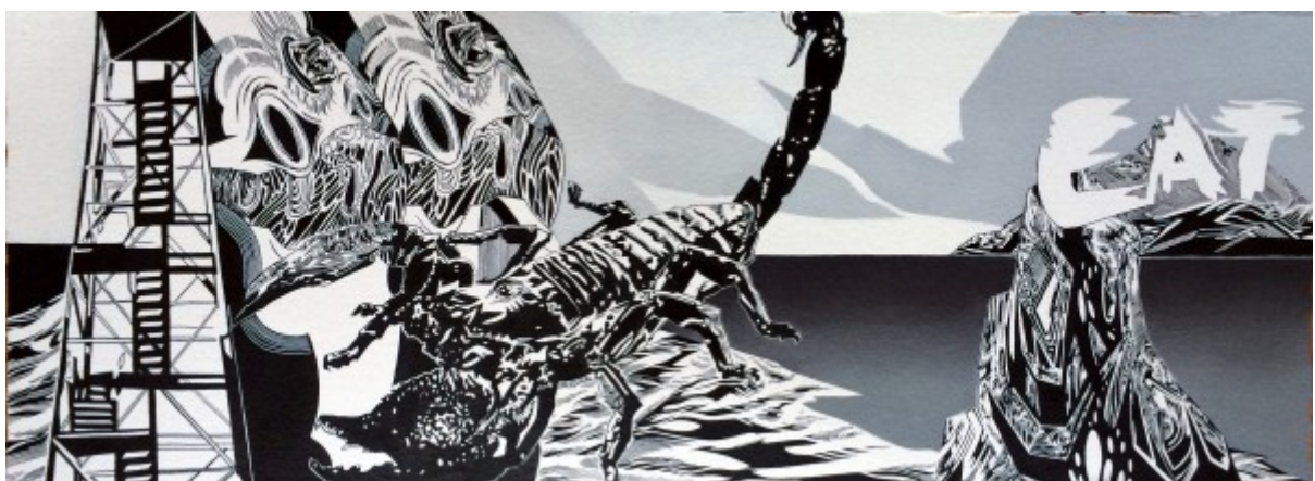
detail of ‘Ink Babel’ 2014 (each panel approx. 11.5” x 30”) ink and oil on paper.