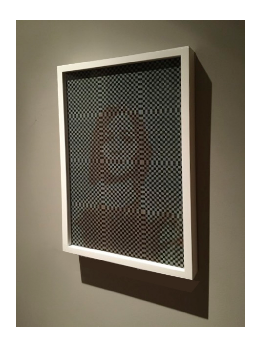
FRAMING SPECIFICATIONS AND ADVICE