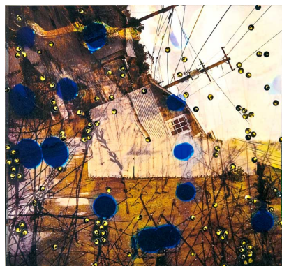
I’ll Huff and Puff, pigment prints and collage, 11.25 x 10.5