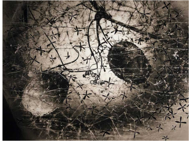
Love Like This Won't Last Forever, pigment prints and collage, 18 x 24