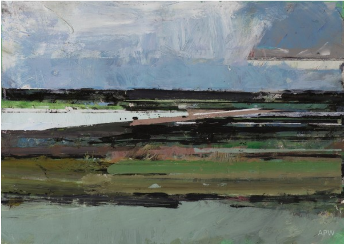
Andrew Wykes "Lacken Strand 1" acrylic on paper, 2015, 22" x 30"