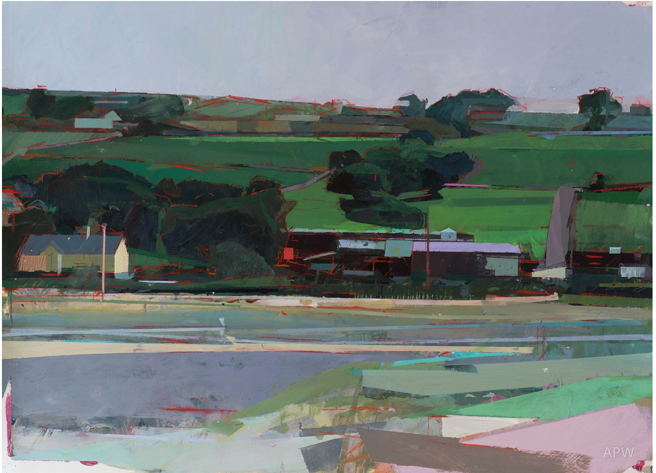
Andrew Wykes "Lacken Strand 2" acrylic on paper, 2015, 22" x 30"