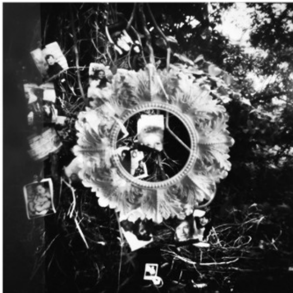
inveni Amy Rockett-Todd 2016