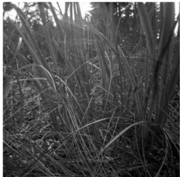
Hold Fast Antonia Small 2016