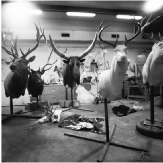
The coyote is in the cooler. Amy Rockett-Todd 2016