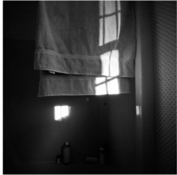
Winter Solstice Antonia Small 2016