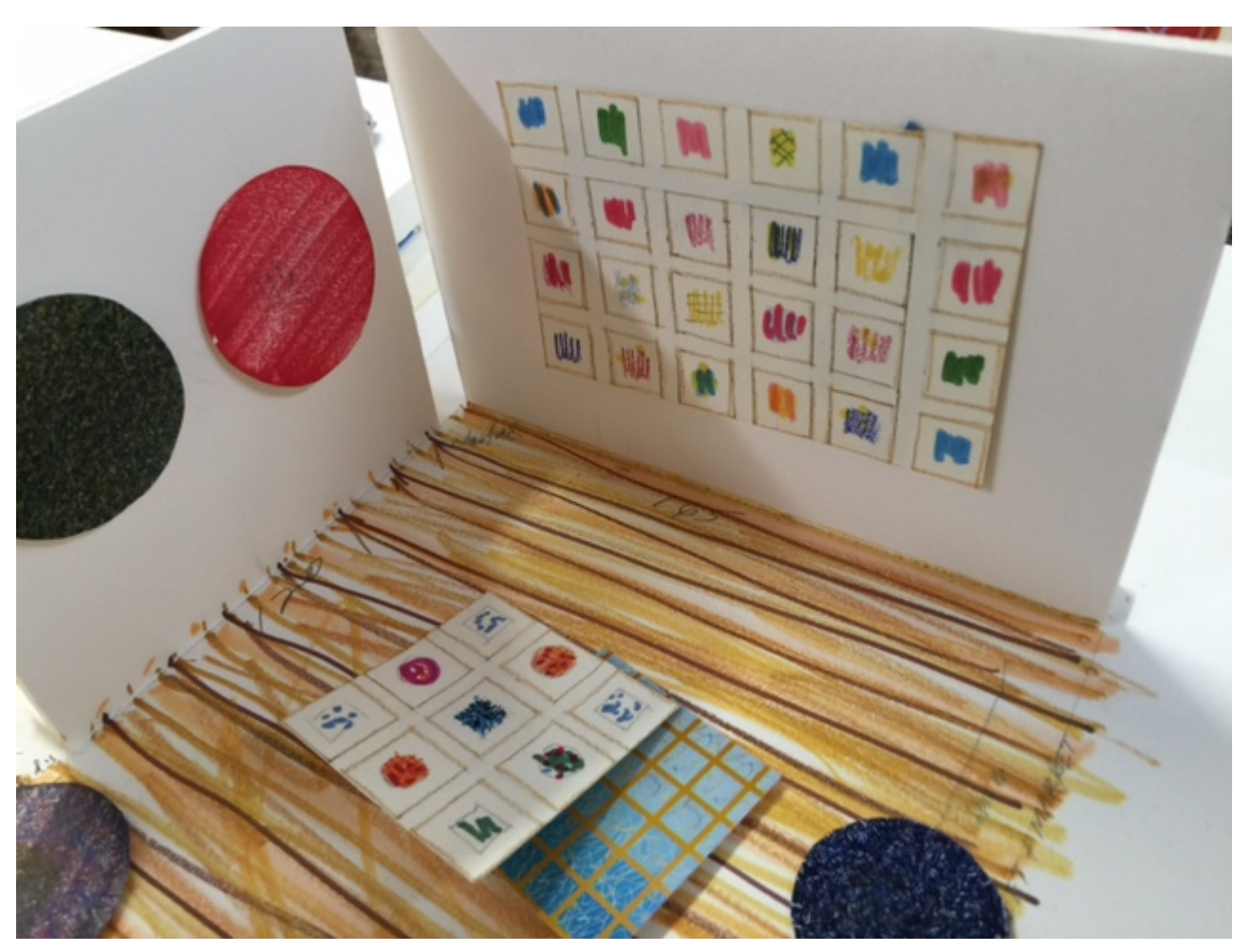
A model of the exhibit is made a month before to show where each image would be hung.

exhibit. Hershey has sent us some work in progress photos to document the process. I think you will agree it was worth the effort.