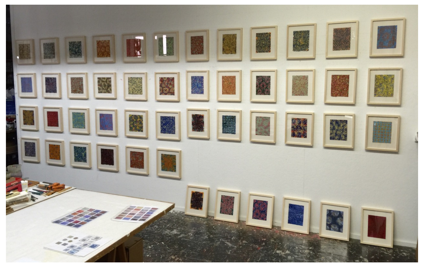
The framing proceeds. All 65 frames are fit and ready to be wired!