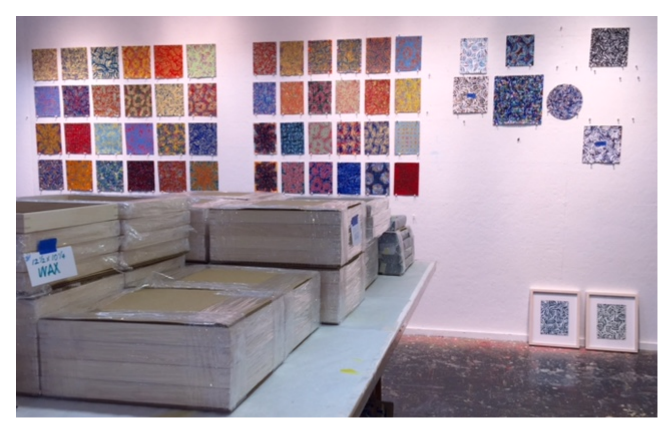
Artwork is positioned on the wall and frames arrive from Metopolitan Picture Framing.