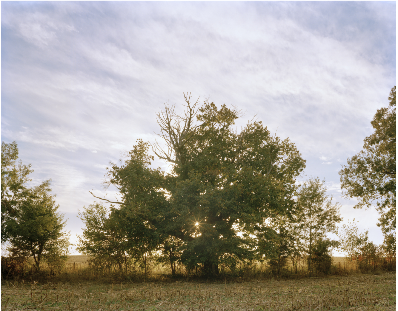
Caroline Allison, Mother Tree, Kentucky , 2016 Archival pigment print; 36 x 46 inches

Believed to be one of the oldest surviving American Chestnut trees to have escaped the chestnut blight of the early 20th century, its precise location remains undisclosed due to concerns about its preservation. Recent efforts to reintroduce a blight resistant variety are largely a result of research done around this particular tree.