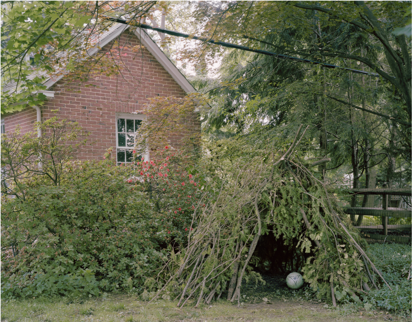
Caroline Allison, Baltimore Hideout , 2016 Archival pigment print; 36 x 46 inches