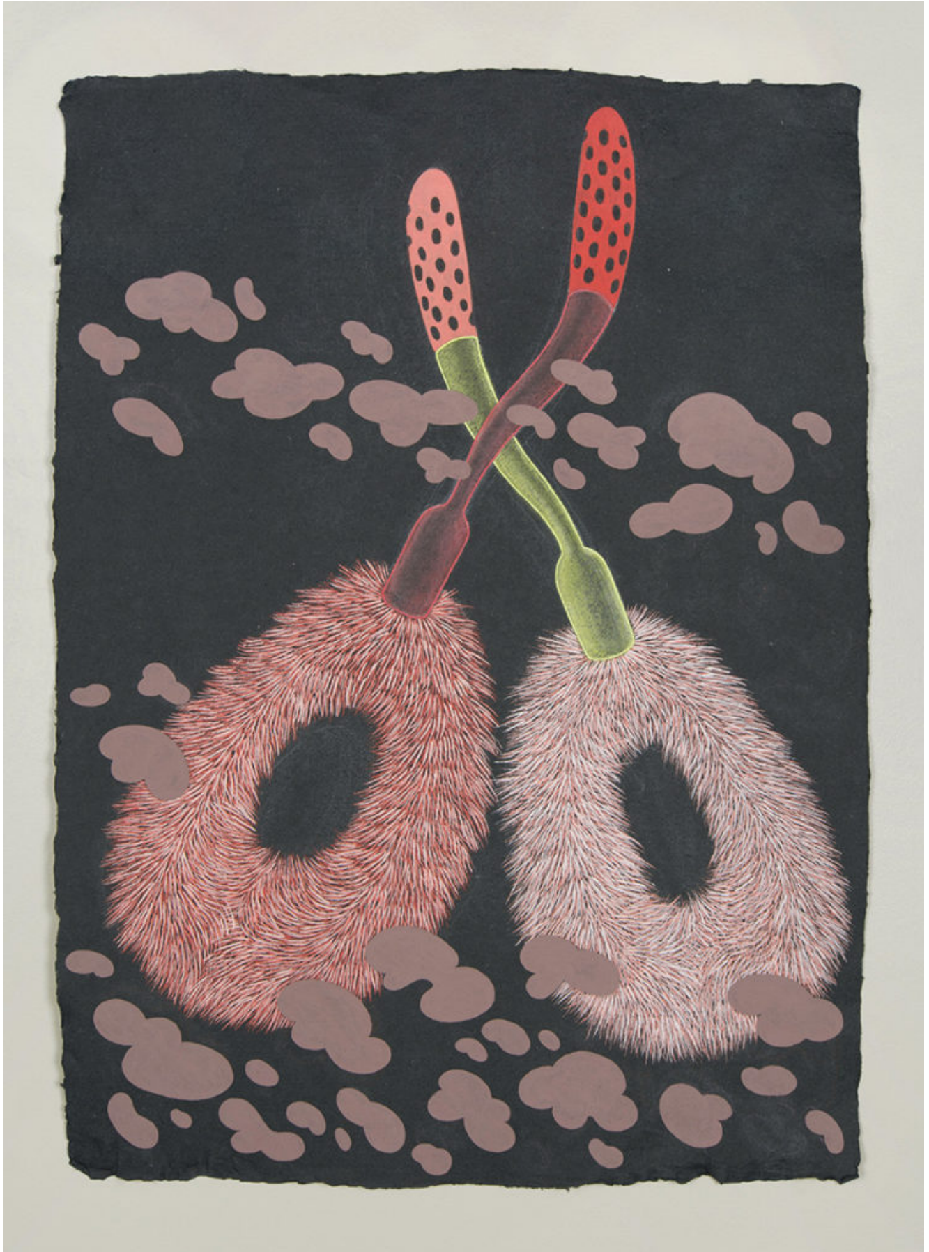
Double Scrub, Gouache and Pastel on Khadi paper, 30" x 22",