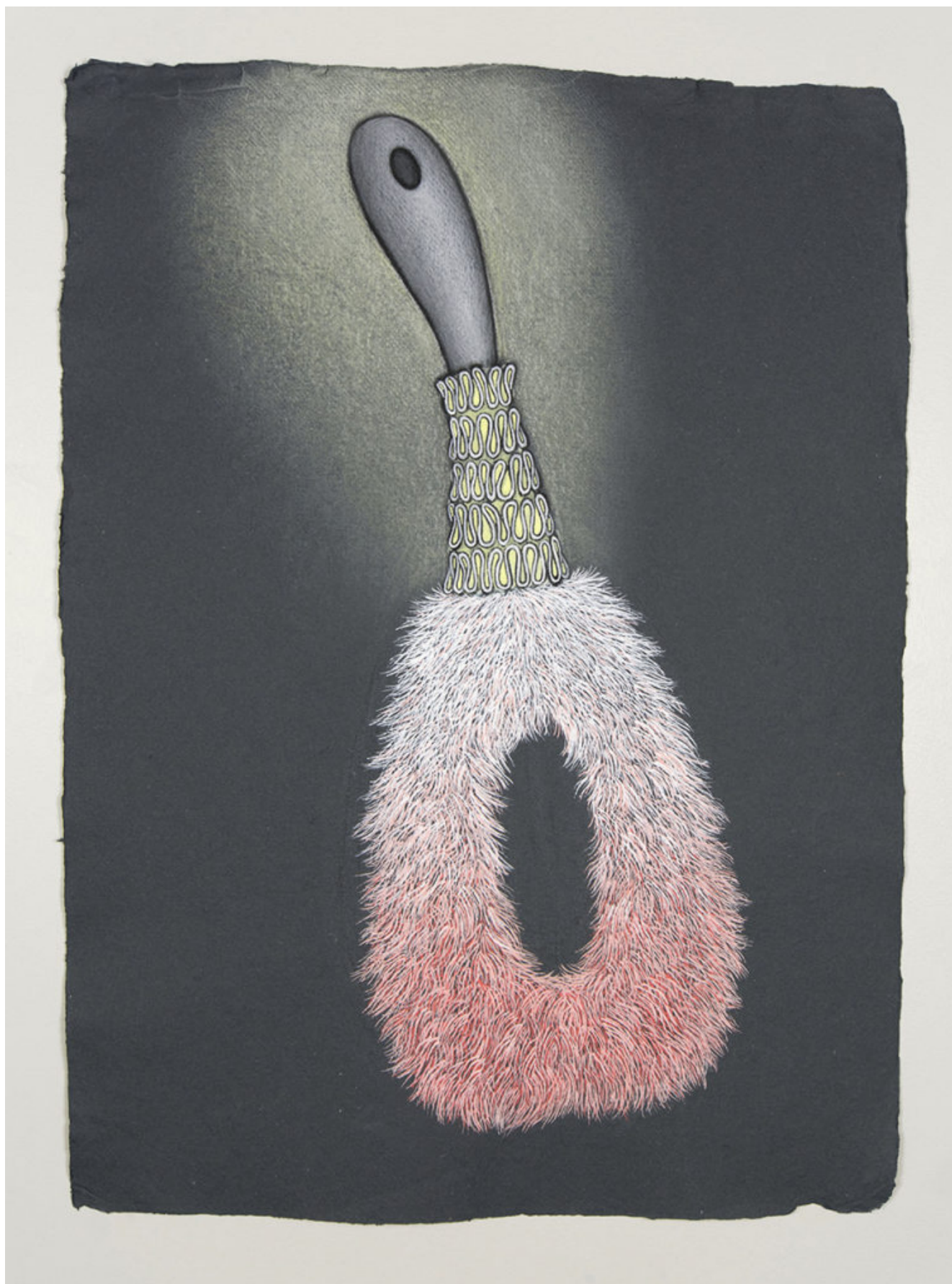
Blusher, Gouache, Charcoal and Pastel on Khadi paper, 30" x

qualities. Graphic line is employed to invoke subtle humor and comics.