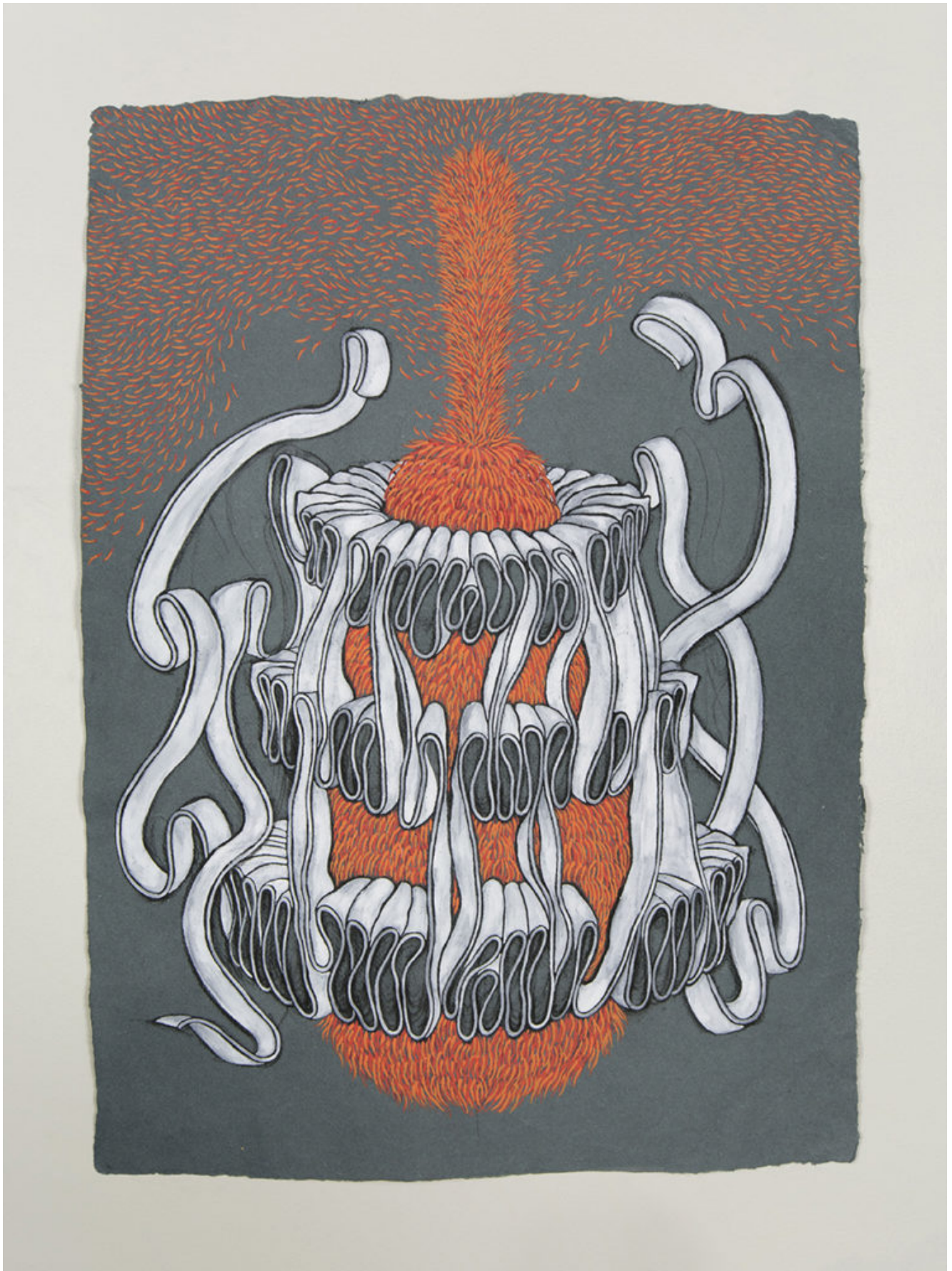
Flee, Gouache and Charcoal on Khadi paper, 30" x 22", 2016