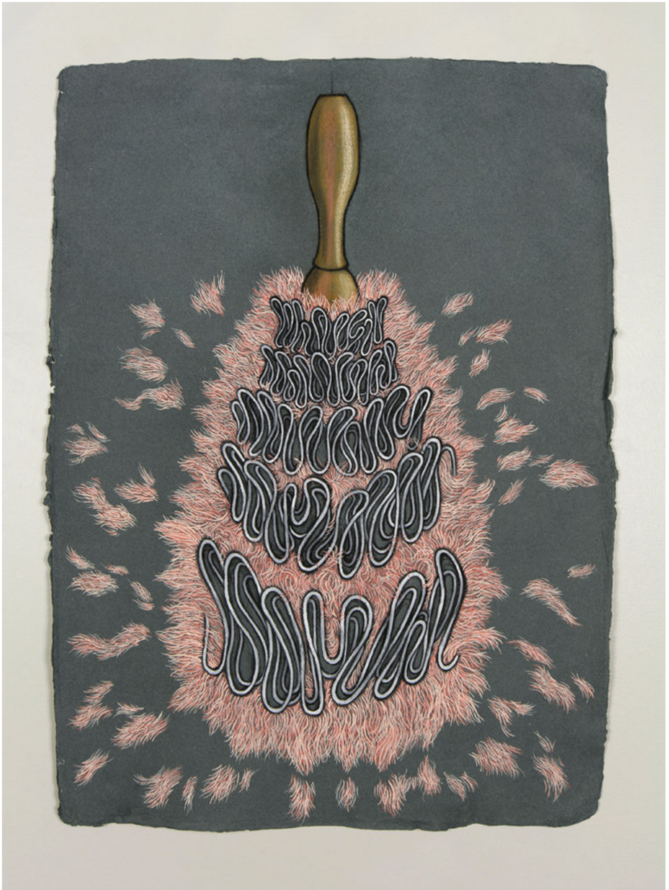
Molt, Gouache, Charcoal and Pastel on Khadi paper, 30" x 22", 2016