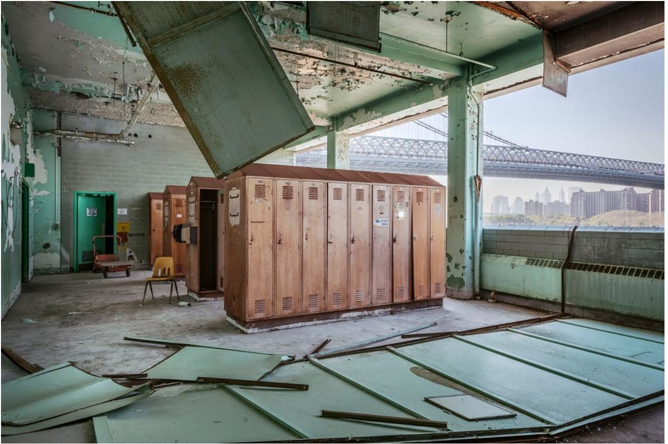
Sweet Ruin Package House Lockers