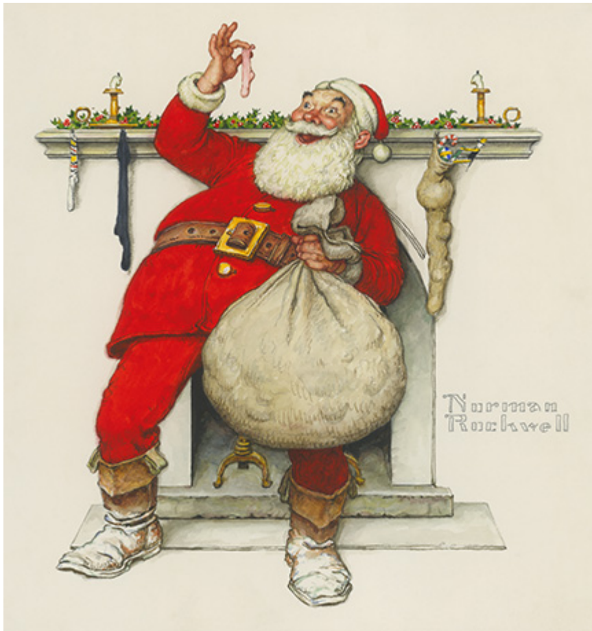
Norman Rockwell , Filling The Stockings , 1955 watercolor, ink and pencil on paper, 13 1/4 x 11 1/2 inches Hallmark Art Collection, Kansas City, Missouri / © Hallmark Cards, Inc.