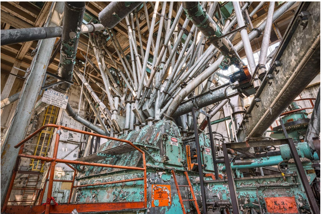
Sweet Ruin Bin Distributor

Front Room Gallery is proud to present a solo exhibition of photographs by Paul Raphaelson, entitled "Sweet Ruin". Featuring photographs taken at the site of Brooklyn's Domino Sugar Refinery, Raphaelson's images chronicle the final state of the once bustling industrial complex before its dismantling and demolition.