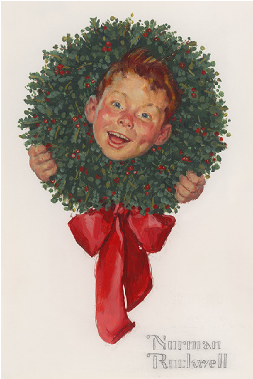
Norman Rockwell, Boy With Head In Wreath , 1957 oil on hardboard, 8 1/2 x 5 3/4 inches Hallmark Art Collection, Kansas City, Missouri