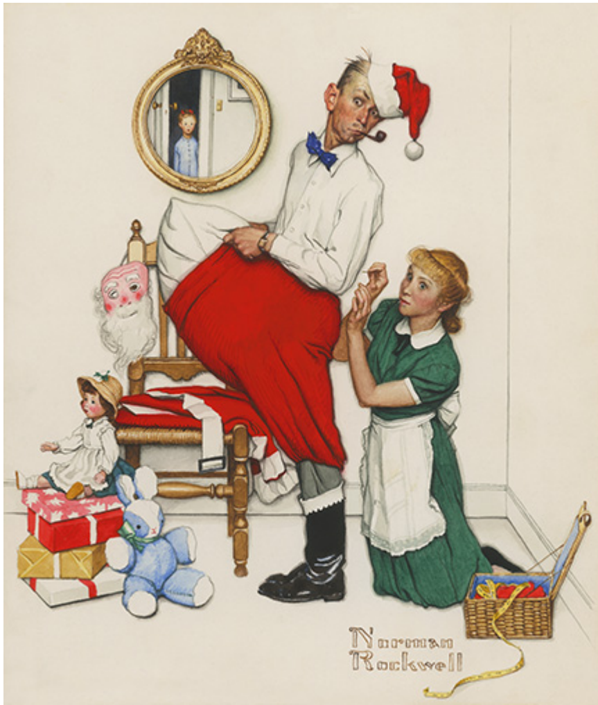
Norman Rockwell, Santa's Surprise , 1949 watercolor and ink on paper board, 12 3/4 x 10 7/8 inches Hallmark Art Collection, Kansas City, Missouri / © Hallmark Cards, Inc.