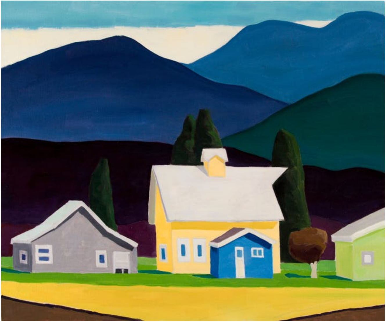
David Ridgway "Big Yellow Barn" 30x 36 Oil on Canvas