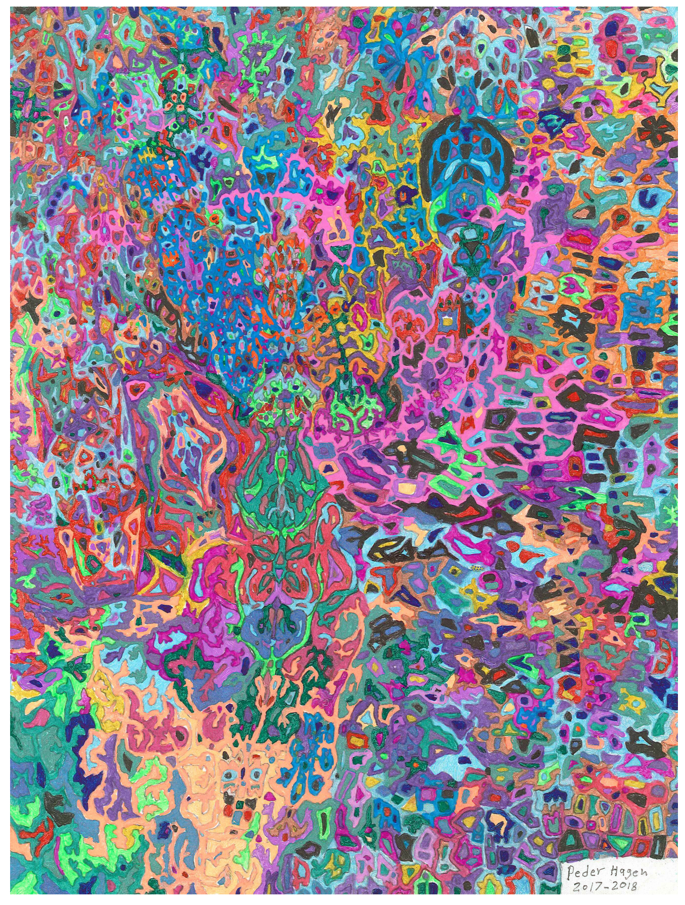
Peder Hagan, Untitled, pencil and pen on paper, 2018