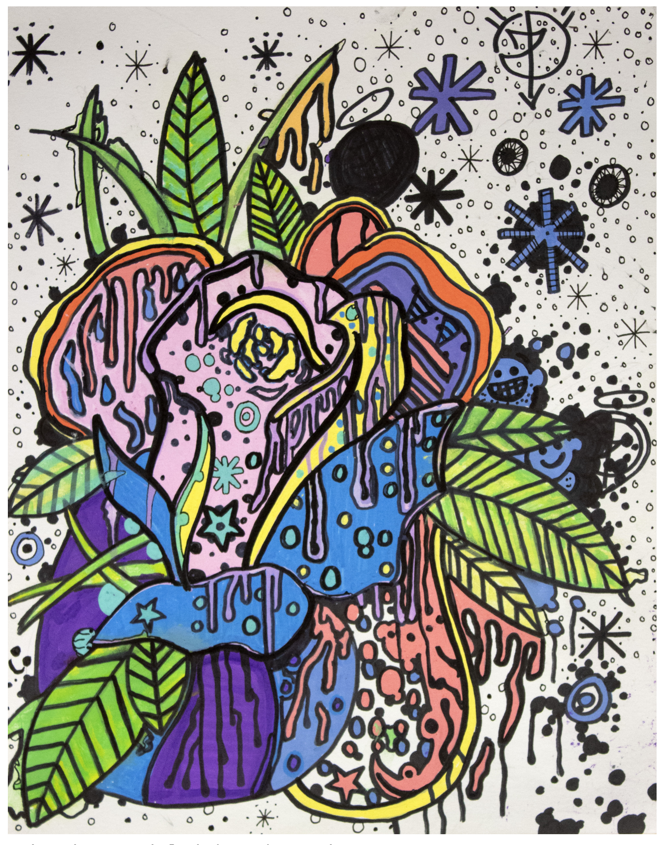
Zack Mohs, Untitled (Rose), marker on paper, 2018