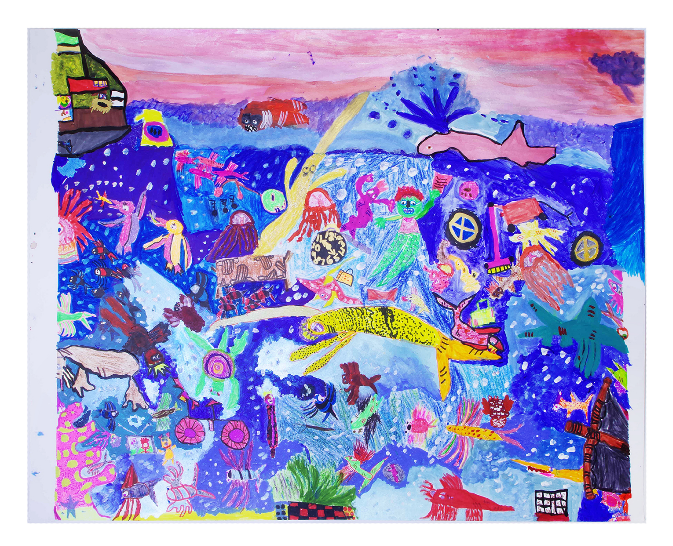
Ashlea Karkula, Under the Sea, mixed media on paper, 2018