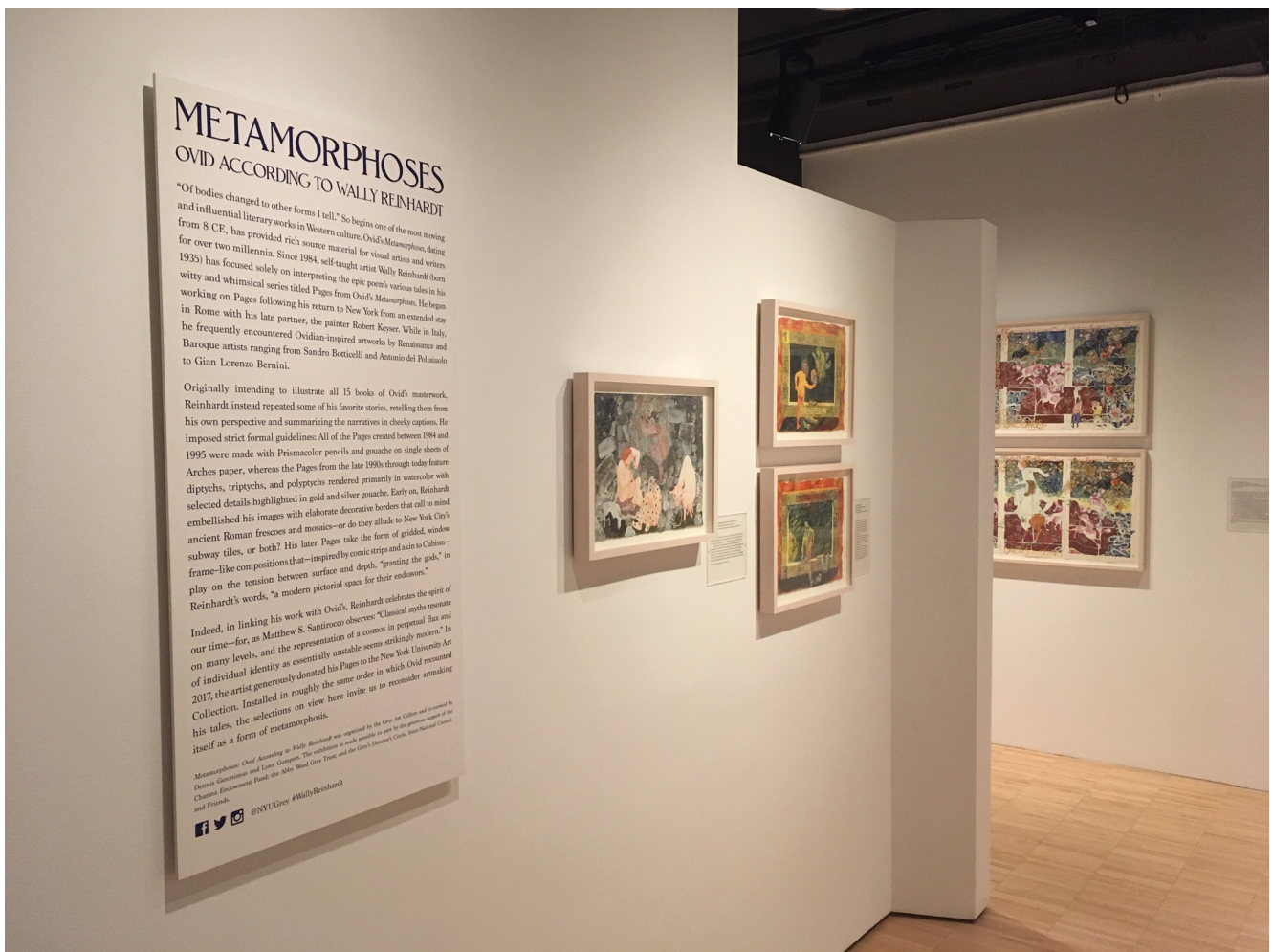
Metamorphoses: Ovid According to Wally Reinhardt Grey Art Gallery at NYU