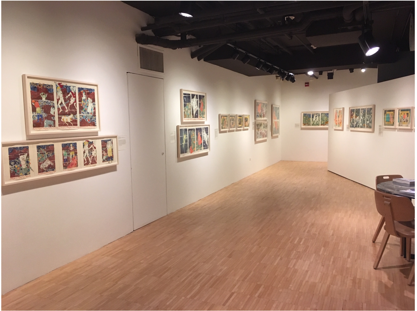
Metamorphoses: Ovid According to Wally Reinhardt Grey Art Gallery at NYU