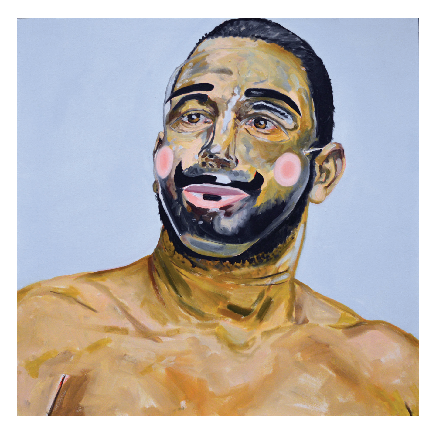
Michael Dixon "I'm a Black Man in a White World", Oil on canvas, 36\text{\~x}36\text{\~x} , 2017