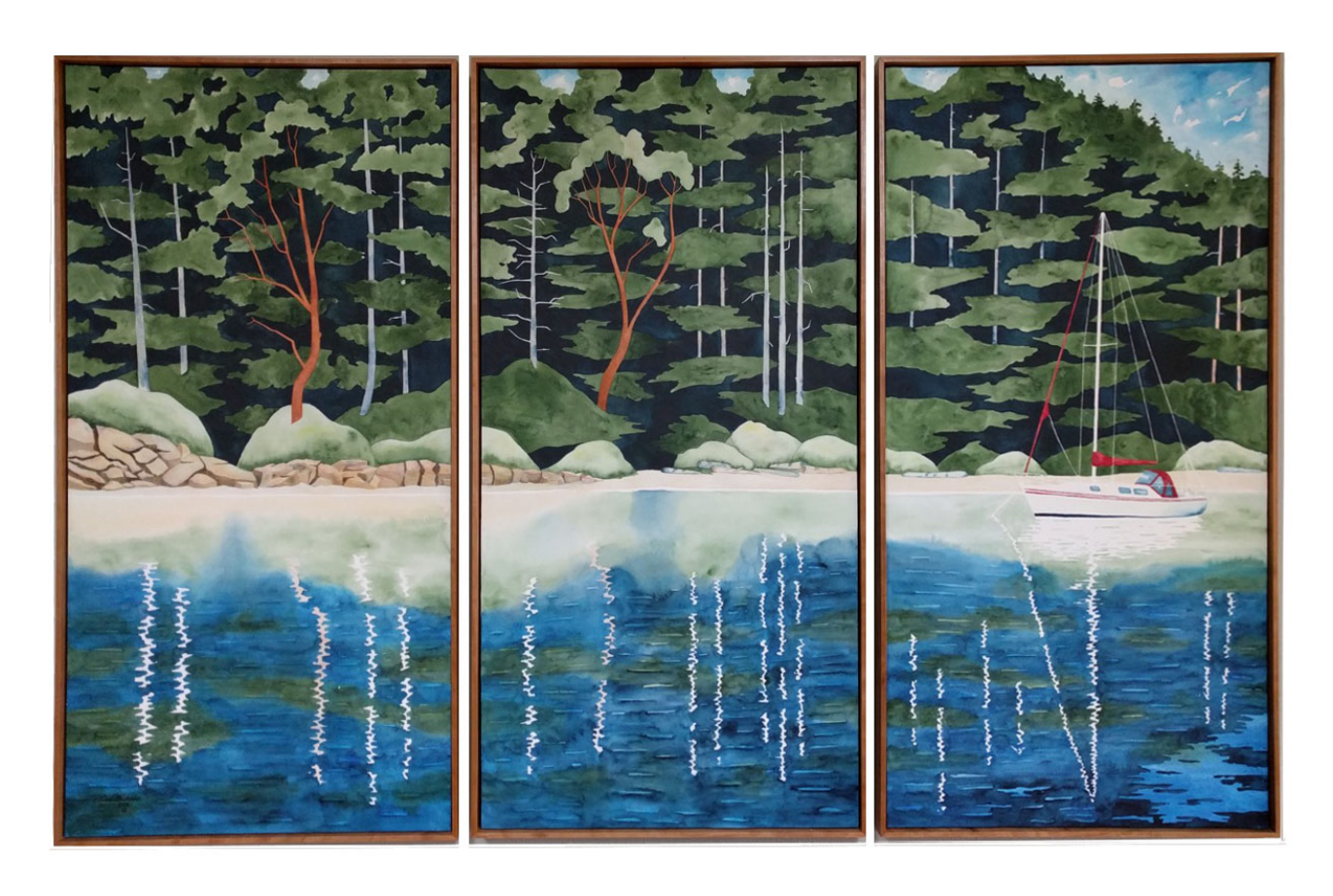
"Shallow Bay Triptych", Watercolor, 3 at 56 x 28 inches each, 2017