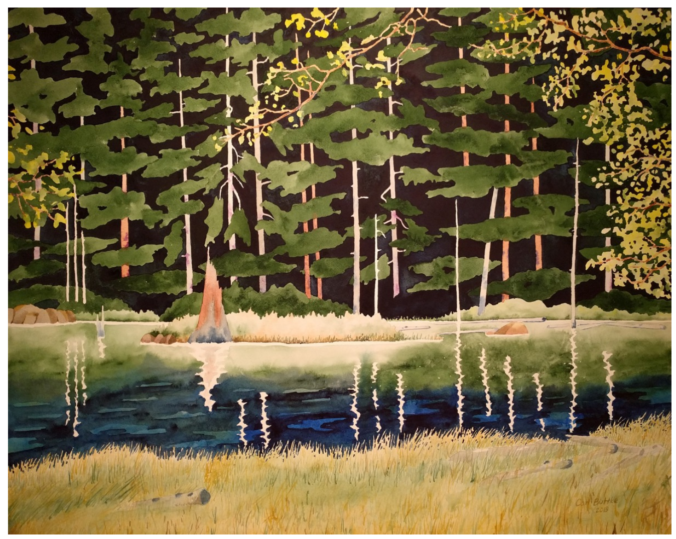
"Mountain Lake North", Watercolor, 20 x 30 inches, 2018.