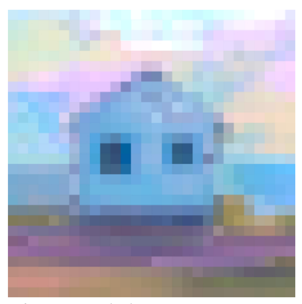
Day's Cottage Painting #4 2017 Archival Pigment Print 22"x22" and 30" x 30", editions of 6