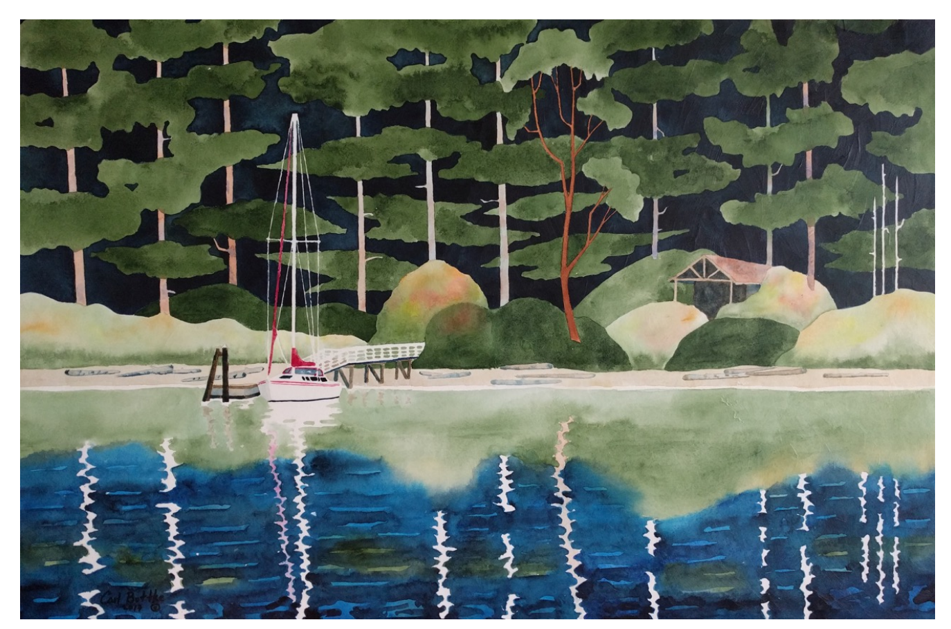
"Reflections of Summer", Watercolor, 20 x 30 inches, 2017