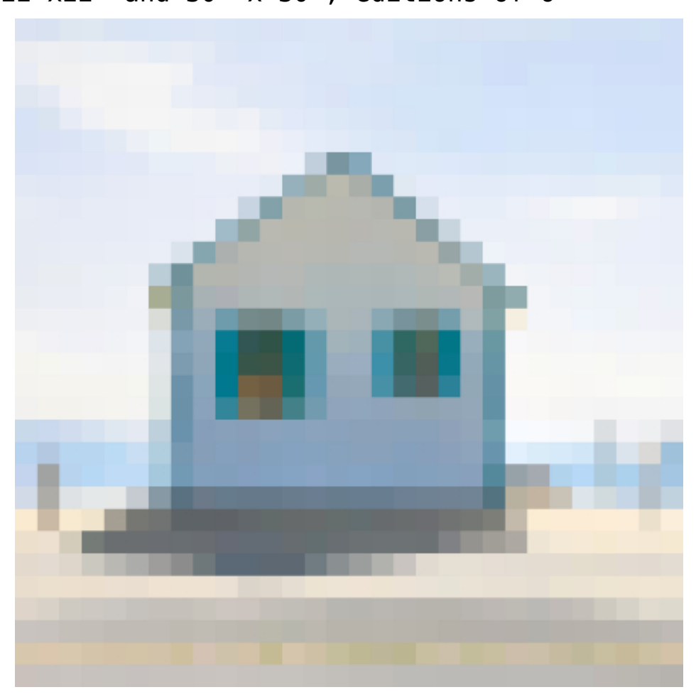
Day's Cottage Painting #3 2016 Archival Pigment Print 22"x22" and 30" x 30", editions of 6

Day's Cottage Painting #1 2016 Archival Pigment Print 22"x22" and 30" x 30", editions of 6