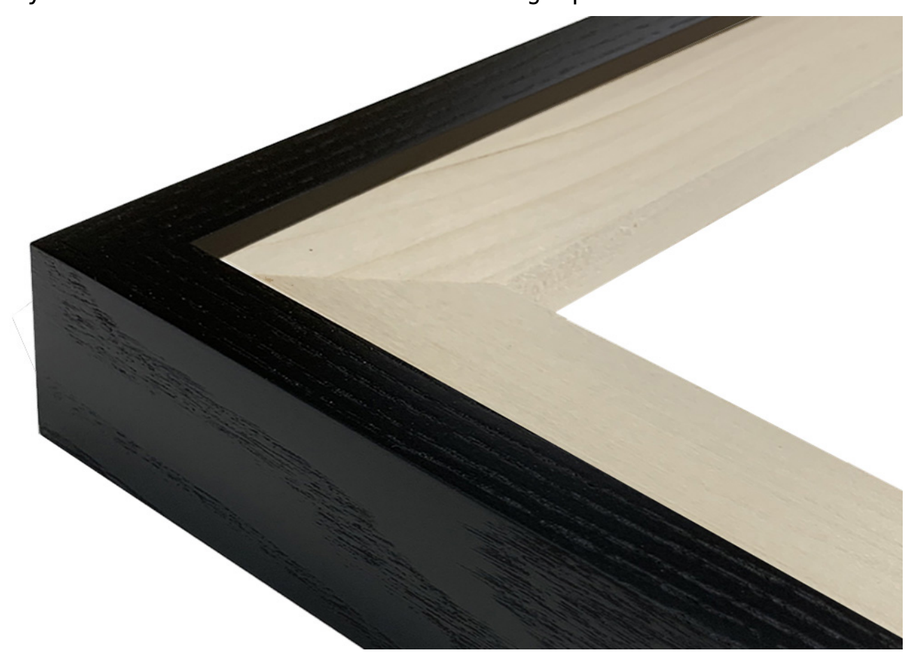
Thin Gallery Frame