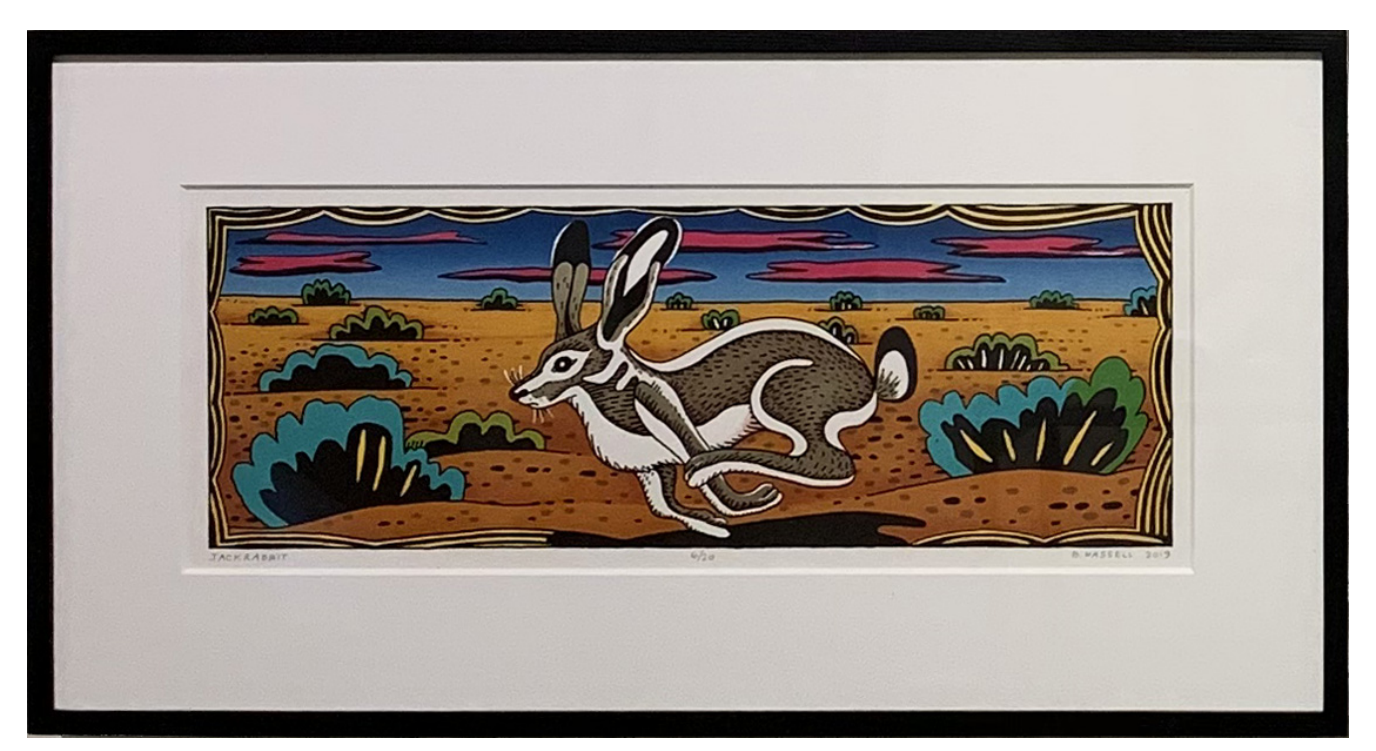
Billy Hassell JACK RABBIT color lithograph 8.5" \times 24"