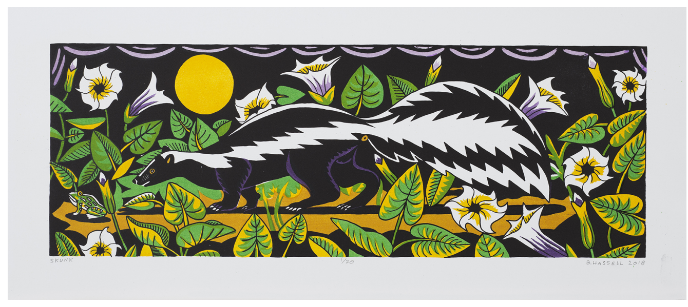
Billy Hassell SKUNK color lithograph 8.5" \times 24"