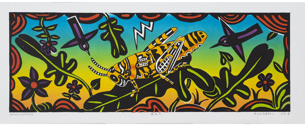
Billy Hassell GRASSHOPPER color lithograph 8.5" \times 24"