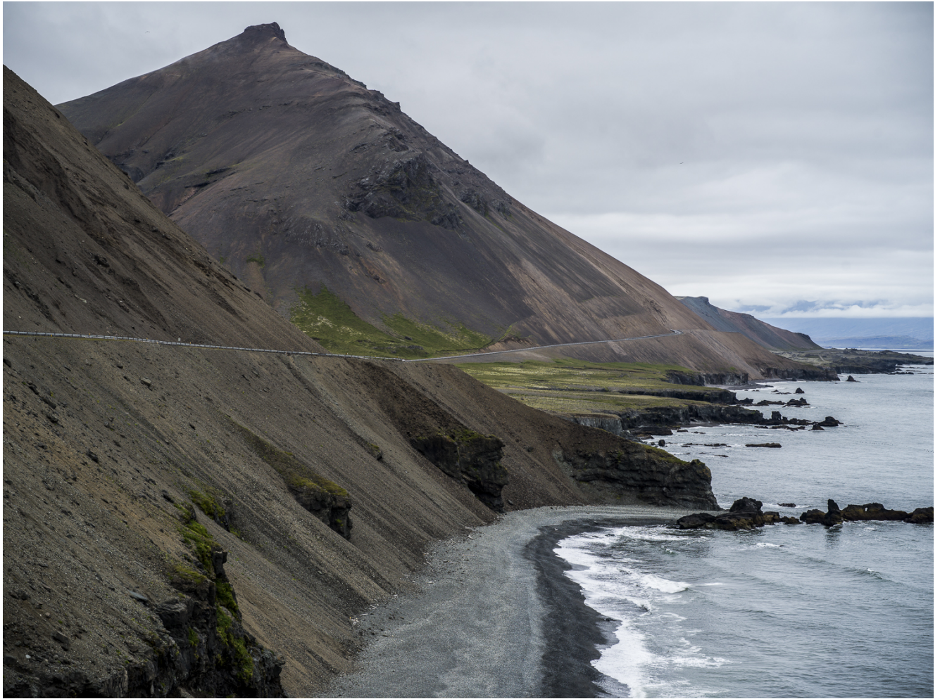
Highway 1 Iceland, 2017 Archival Pigment Print 21 X 28"