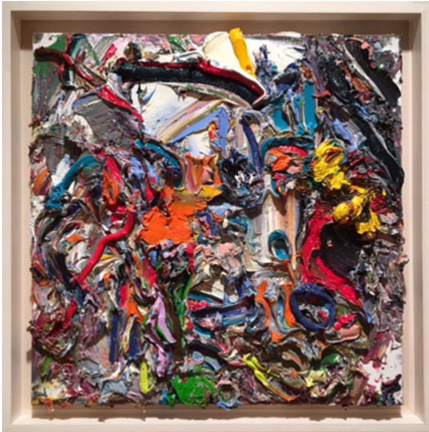
Ying Li The Secret Garden, Insects and Butterflies, oil on linen, 16 x 16 inches