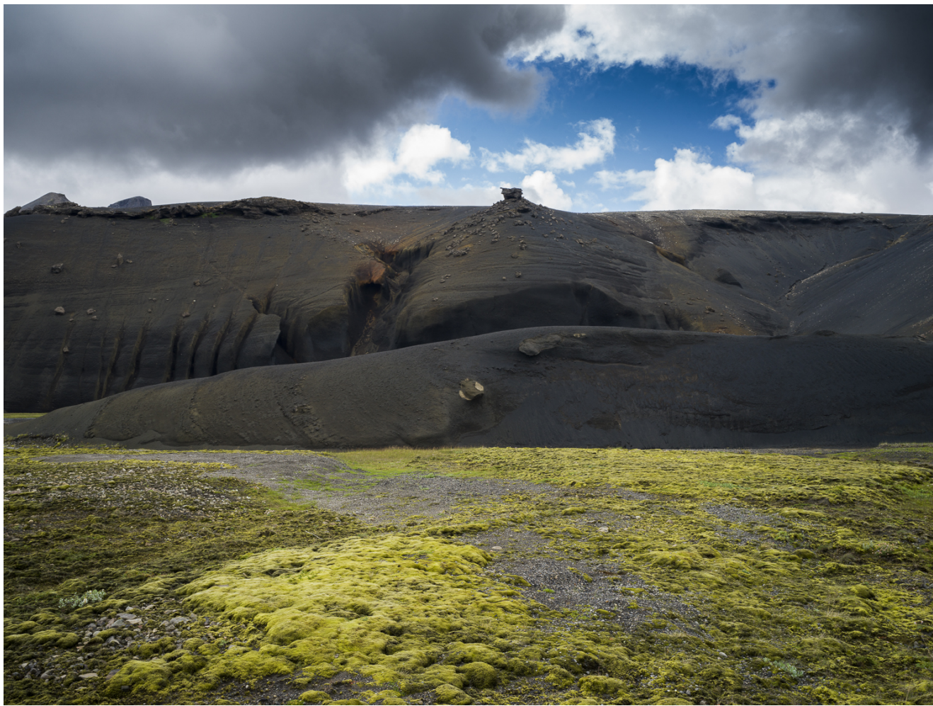
Volcanic Flows Iceland, 2017 Archival Pigment Print 21 X 28"