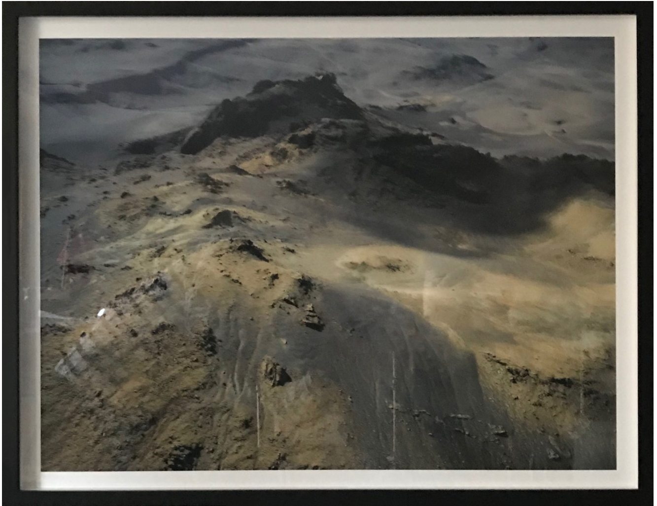
Volcanic Aftermath Iceland, 2017 Archival Pigment Print 21 X 28"