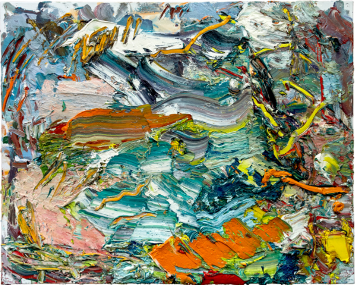
Ying Li, Grassy Waters #1, Oil on linen, 24 x 30 inches