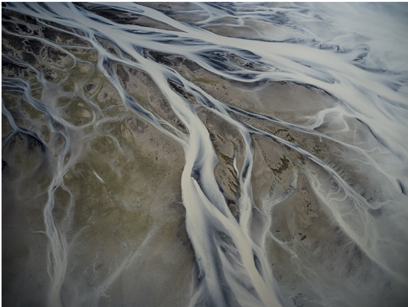
Glacial Outflow Iceland, 2017 Archival Pigment Print 21 X 28"