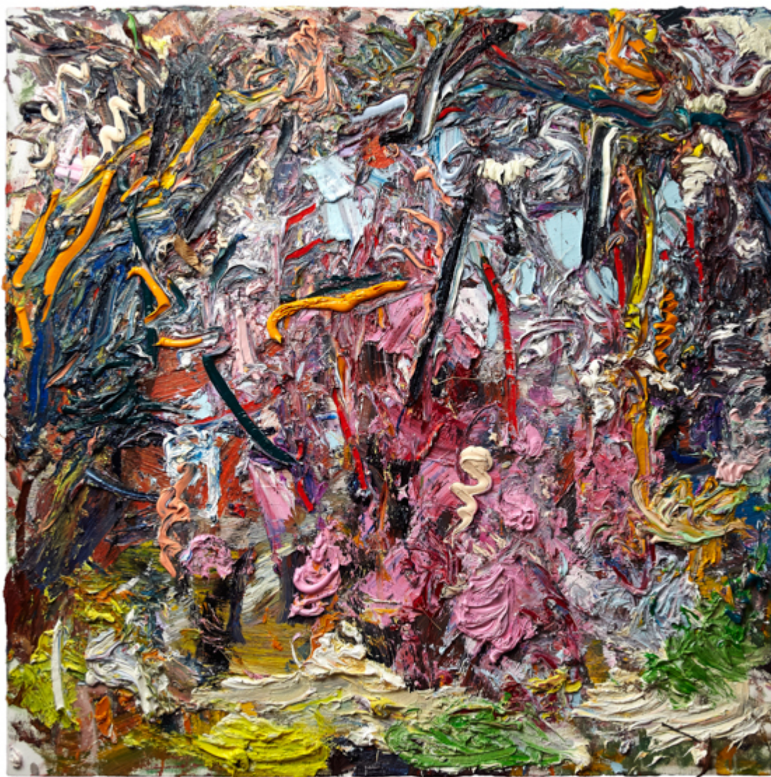
Ying Li, Cherry Blossom, Oil on linen, 36 x 36 inches