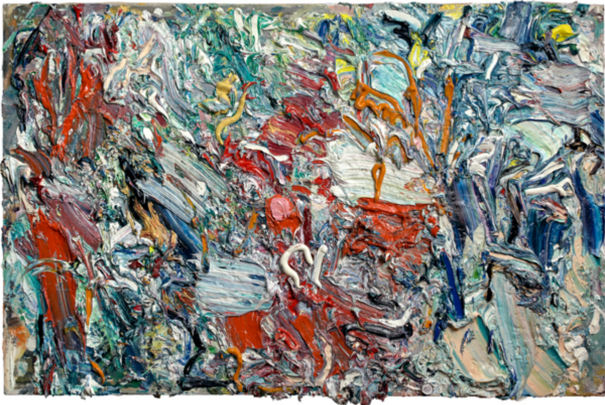
Ying Li, Wintry Garden, Oil on linen, 24 x 48 inches