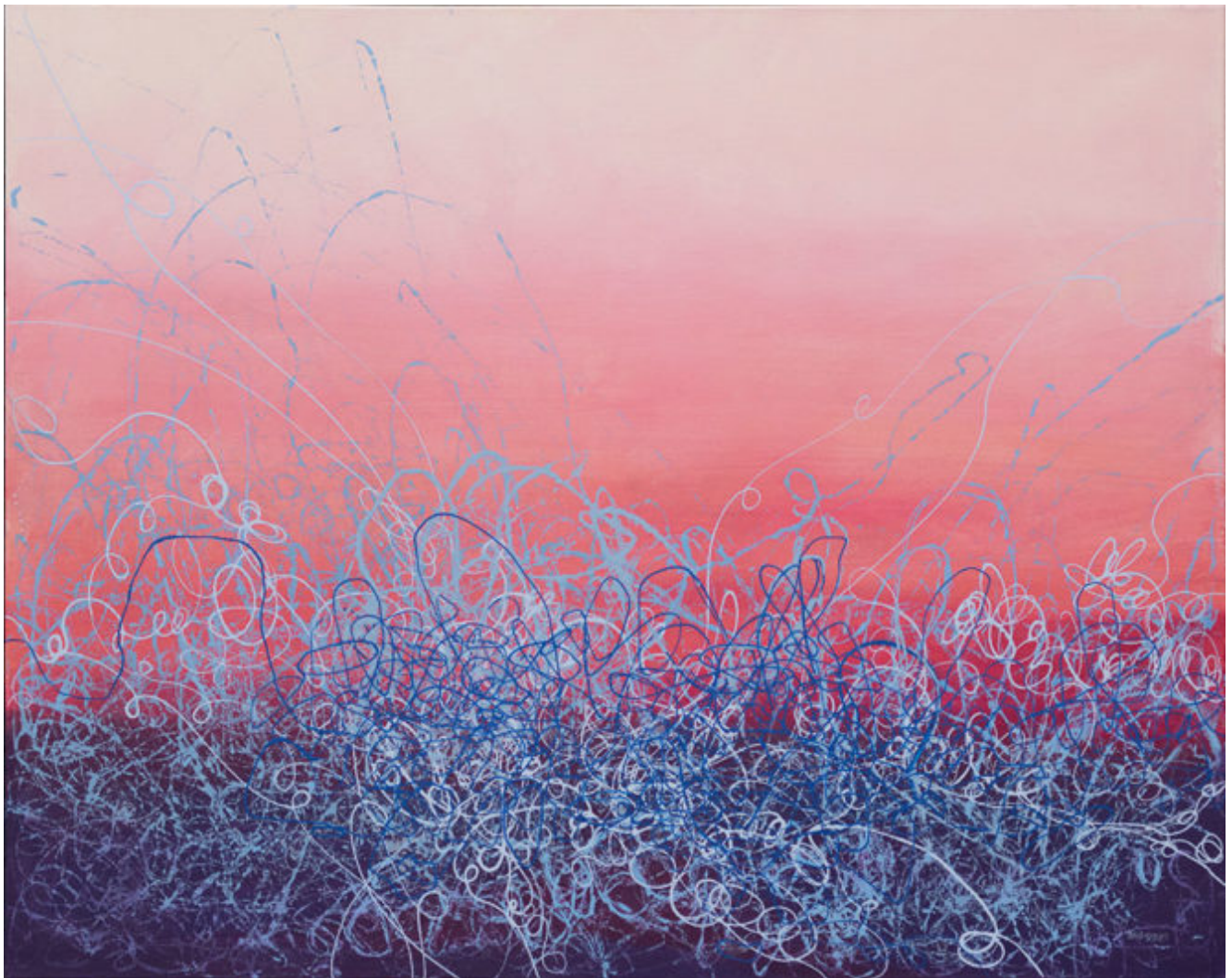
Scramble, 36" x 48" acrylic