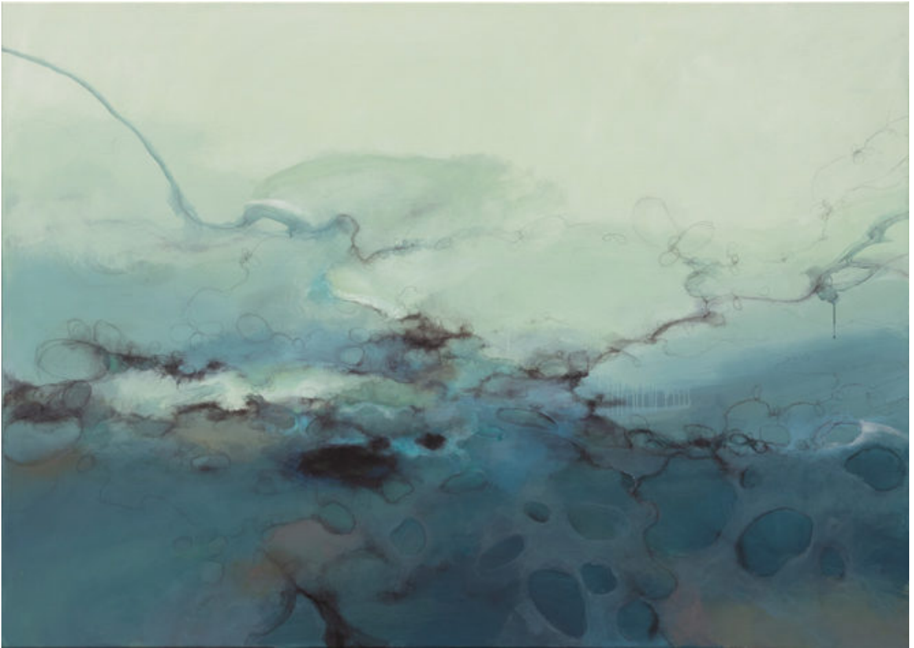
Melt 60" x 84" mixed media on canvas