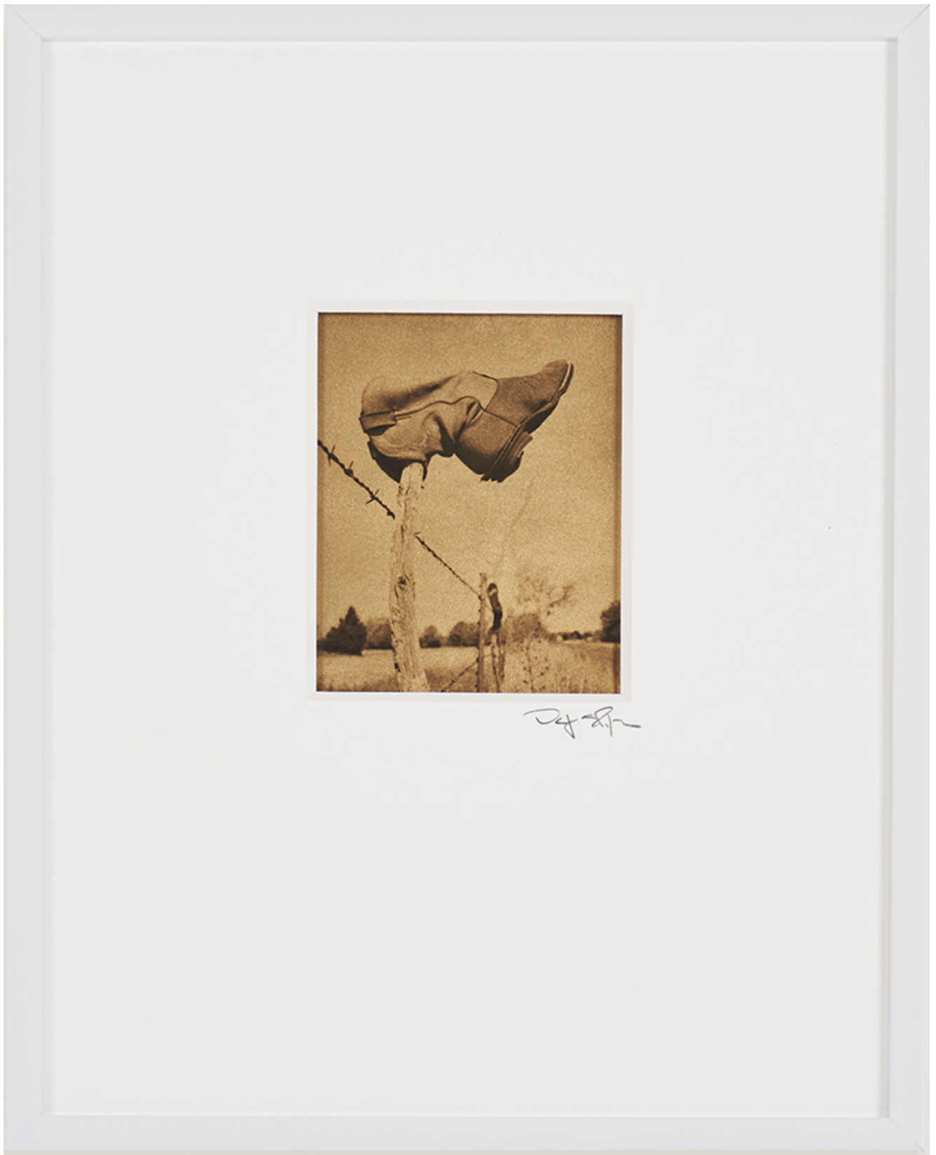
Cowboy Boot No. 2, 2019 4" x 5" archival pigment ink in acrylic – photograph reverse gilding with gold leaf