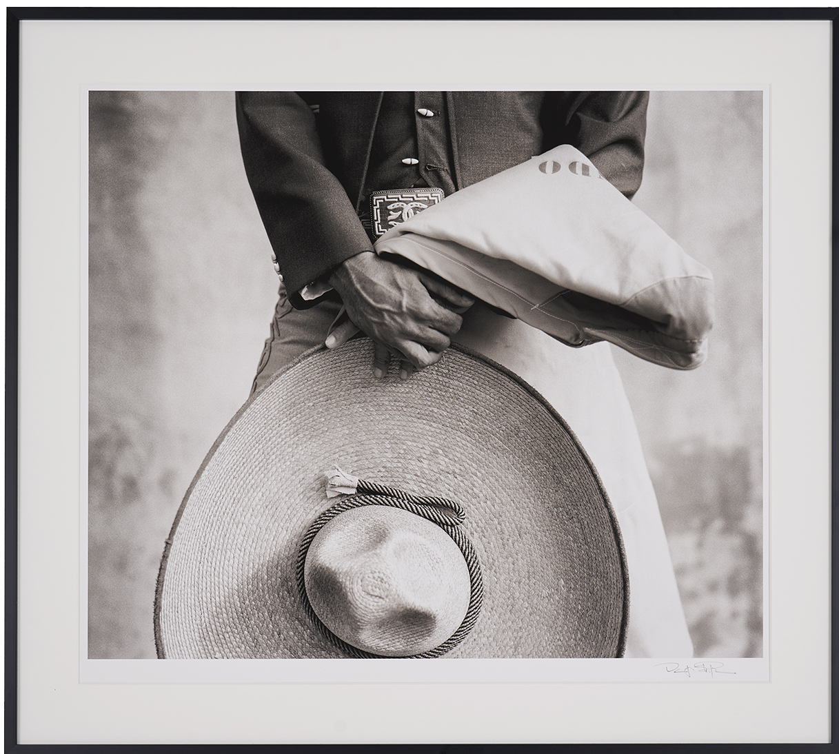
Sombrero, 2015 24" x20" archival pigment ink – Photograph Hahnemühle Photo Rag 308 100% Cotton/Acid-Lignin Free