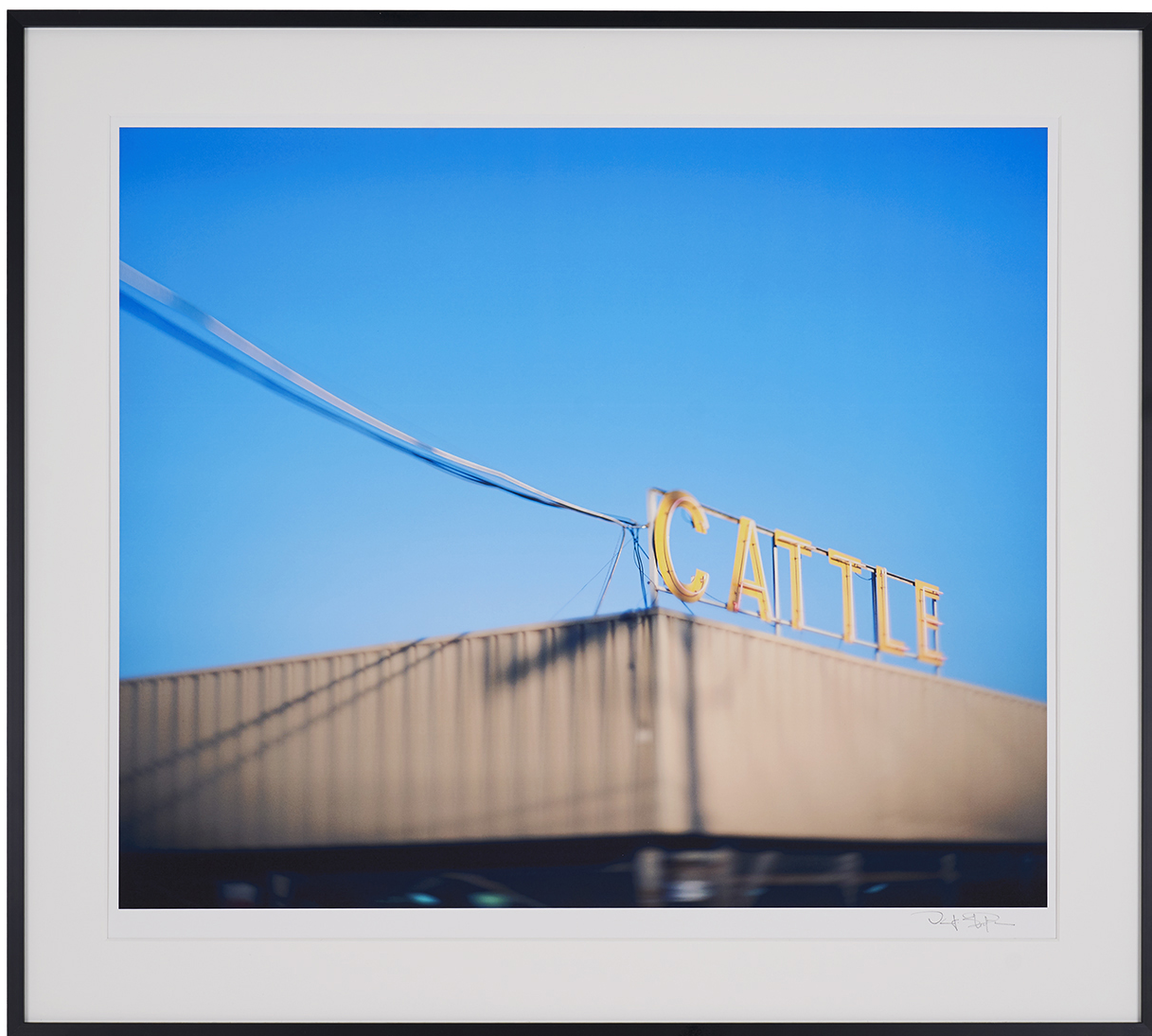
Cattle, 2015 24" x20" archival pigment ink – Photograph Hahnemühle Photo Rag 308 100% Cotton/Acid-Lignin Free