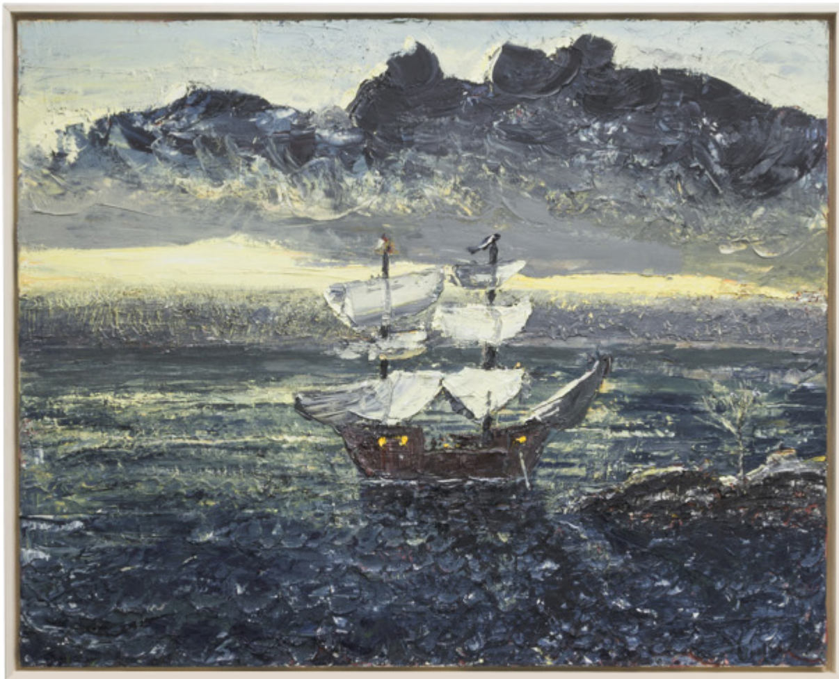
Mayflower November 11, 1620, 2019 acrylic, oil on canvas 48 x 60 in