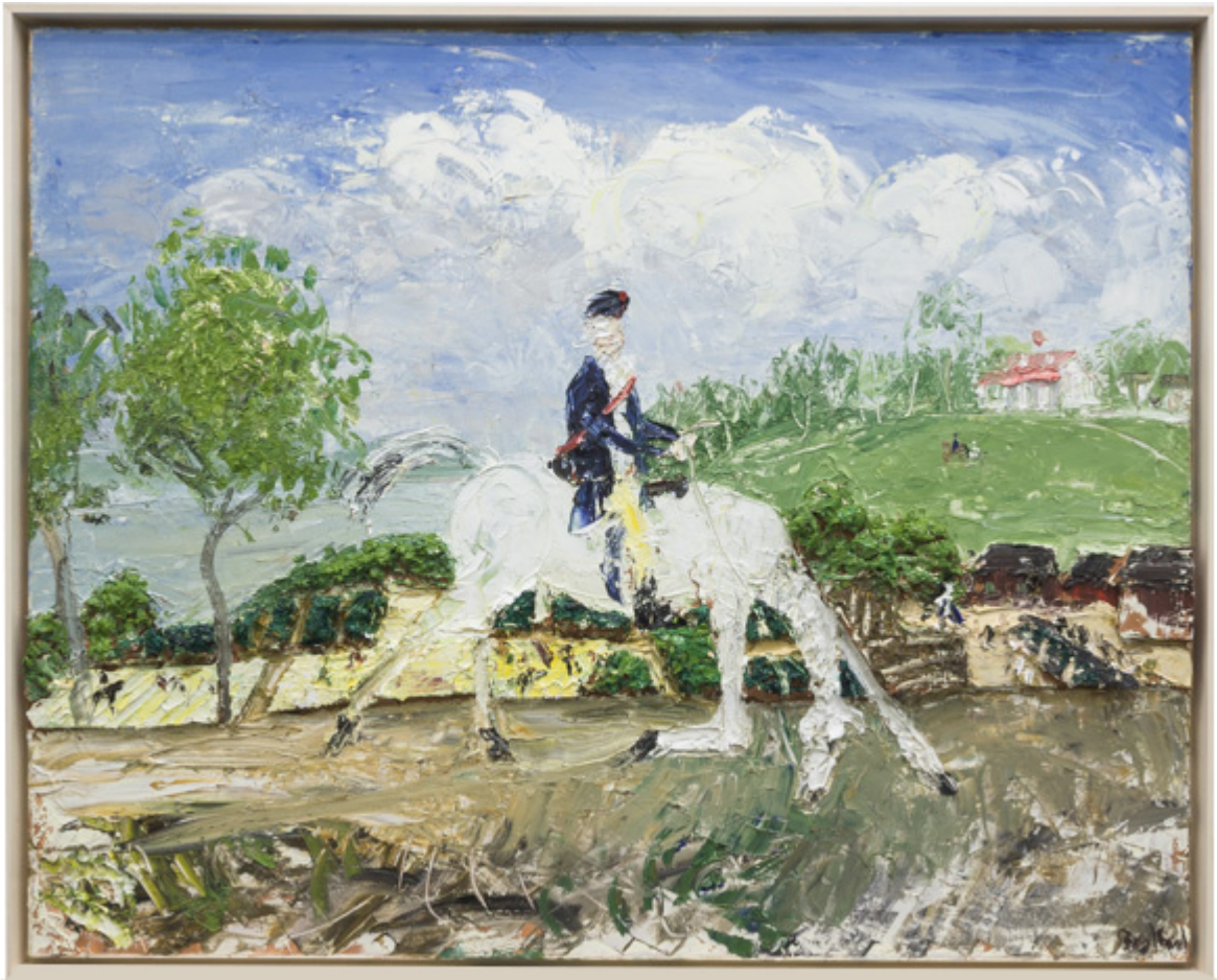
Washington Returns to Mount Vernon, 2019 acrylic, oil on canvas 48 x 60 in