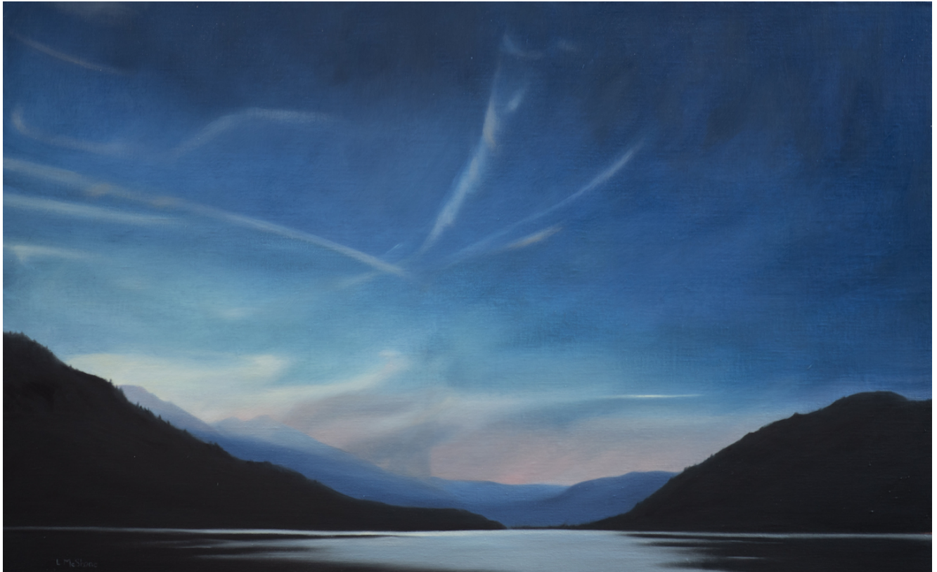
Okanagan: Fire on the Horizon, 2020, Oil on Linen Panel, 26" x 42"