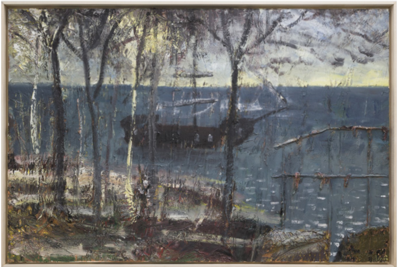
Plymouth Rock, 2019 acrylic, oil on canvas 48 x 72 in