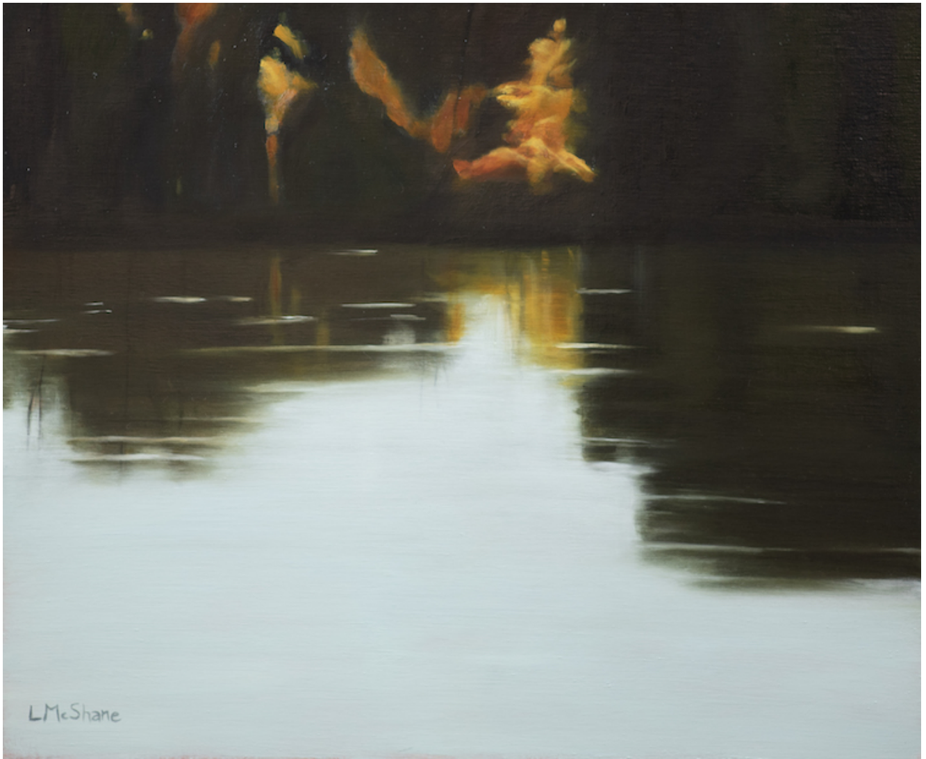
"Yakama: Autumn on the River", Oil on Linen over Aluminum, 20" x 24"