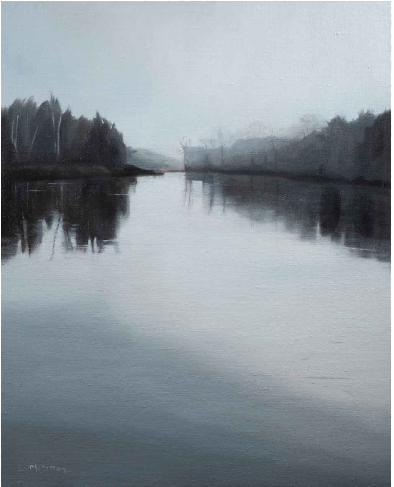
"Lhaq'te'mish: Morning Fog" on the Nooksack Delta, 2020, Oil on Linen over Wood Panel, 30" x 20"