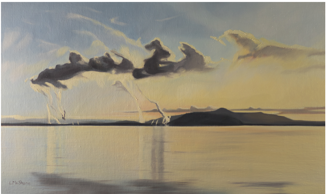
Lisa McShane "January 6, 2021", Oil on Linen on Wood Panel, 24" x 40", 2021